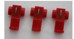
(8) MidWay connector

1. For W204 2011-2013 the car has DRL to improve the color to 6000K and 50% light to 100% light on.